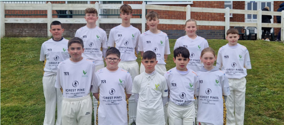
Contributor Neil Simpson

Broughton Cricket Club have, for the last few weeks, been running some technical coaching sessions for our Under-11 and Under-13 boys and girls, with some additional sessions for our Under-15/16 girls. Over the course of the sessions we have been working in small groups of between 6 and 10 kids and have been working on: